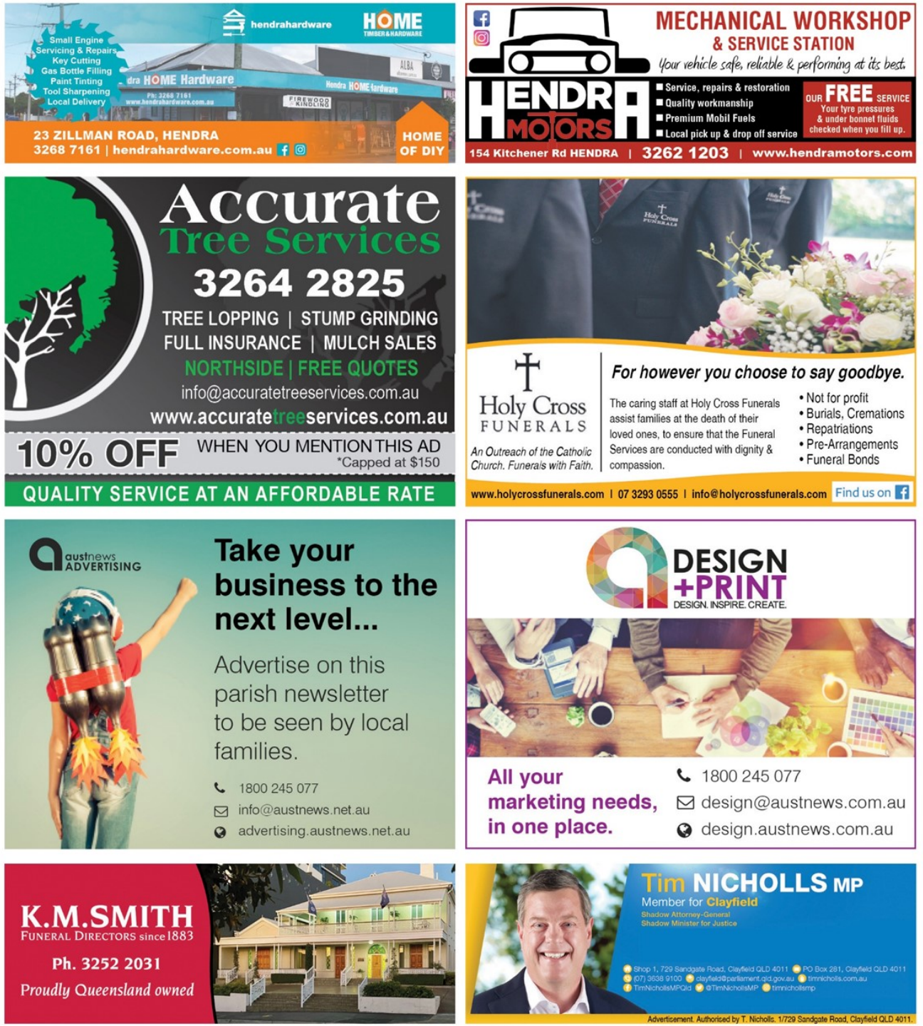
These advertisers support us, please support them.