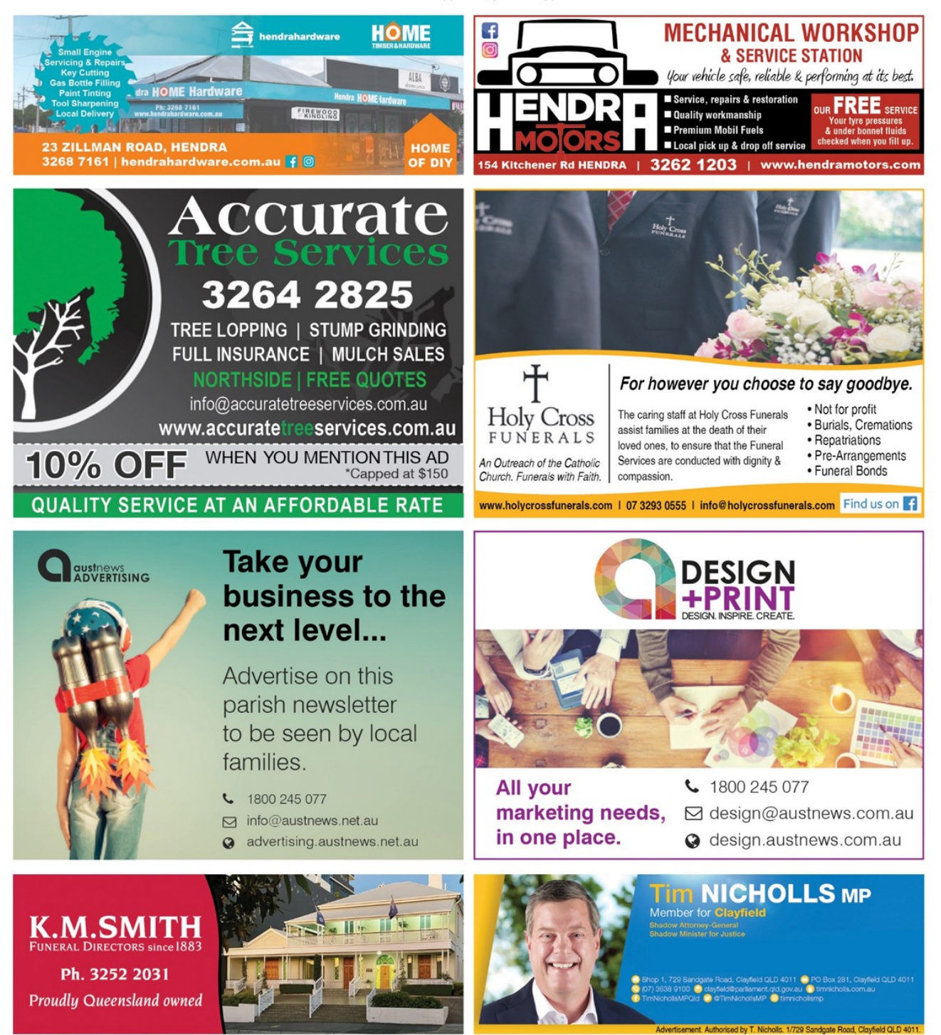
These advertisers support us, please support them.

Australian Newsletter Services P/L, Authorised Supplier of Newsletter Covers For Schools & Churches Ph: (07) 3290 1966, Freecall: 1800 245 077, Email: info@austnews.com.au